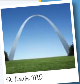
St. Louis, MO