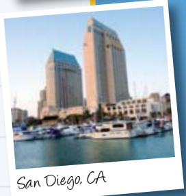
San Diego, CA

April 23-24, 2010 Hilton at the Ballpark St. Louis, MO